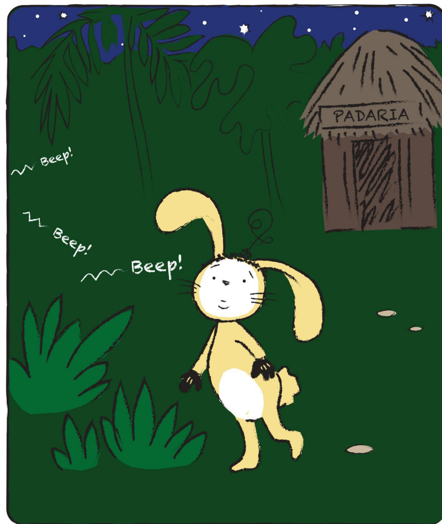
That night, Space Rabbit hears a space signal and leaves to find her family all by herself.